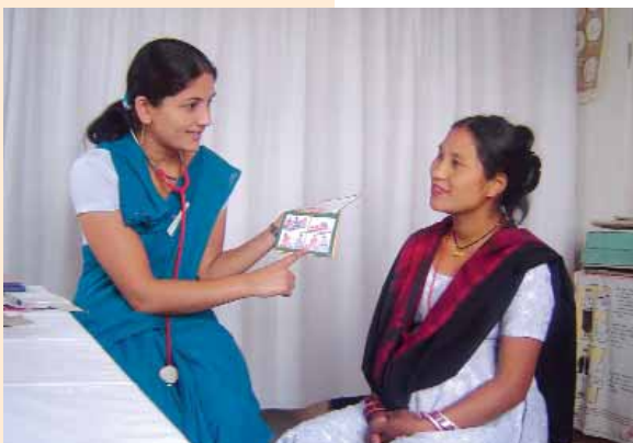
The Birth Preparedness Package is an important tool to help pregnant woman and their families plan for childbirth

For the last 18 months, the Safe Motherhood Innovation Project (SMIP) has been working in six of the Eastern Region Districts (Dhankuta, Terhathum, Taplejung, Sankhuwasabha, Khotang and Ilam) in partnership with the Britain Nepal Medical Trust (BNMT) and in close collaboration with district health offices and regional health directorates. This project (funded by the European Union) is aiming to reduce maternal mortality and morbidity due to pregnancy related complications in these six districts by increasing the number of pregnant women attended by skilled and equipped birth attendants.