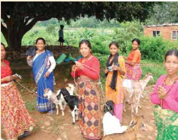
Our new goats

Altogether 350 farmers participated in the training from Taukhal, Sanga, Mahendrajyoti, Janagal, Subbagaon, Malpi, Rayale, Baluwa, Hokse and Sathighar VDCs.