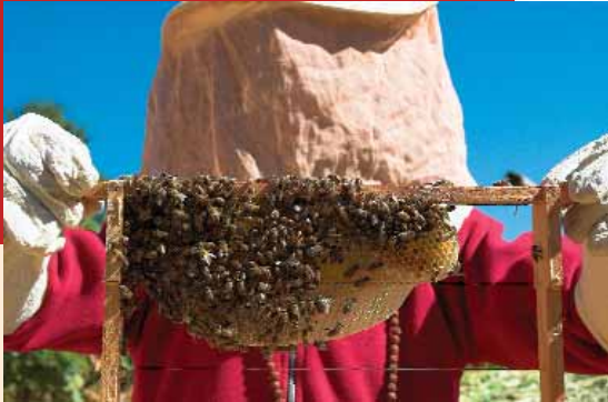
Learning to work with bees

Since March 1 st 2004 ADRA Nepal has been running a Sustainable Development Through Integrated Agriculture Project in Kavre District, financed by the Canadian International Development Agency (CIDA). The overall goal of the project, which will run until March 2006, is to improve the quality of life among the rural population in 10 targeted village areas.