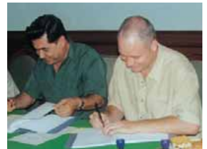
Signing the agreement with Nepal Red Cross Society

The first year of the project has proved to be an important year in establishing the foundations of the project. The key project achievements include the writing and presentation of the Detailed Implementation Plan, establishing a partnership with Nepal Red Cross Society, engaging in technical support and capacity building activities, coordination and collaboration with key stakeholders, conducting assessments, receiving approval of the training site at Koshi Zonal Hospital, Biratnagar, recruitment of staff and establishment of an office in Biratnagar and the Safe Motherhood Innovation Project Match Activities.