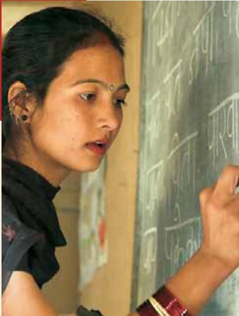
Literacy class facilitator from Dang

Earlier this year a team comprising staff of ADRA, New Young Star Club (NYSC) and the Backward Society Education (BASE) completed a baseline survey for the Women's Poverty Alleviation Project in Banke, Bara, Dang and Kavre Districts. Despite serious disturbances from strikes and military action by various parties in the ongoing conflict in Nepal, the team were able to interview 522 women and conduct eight focus group discussions.